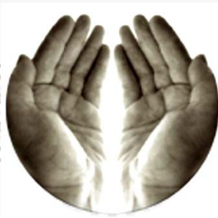
Labor Day Weekend